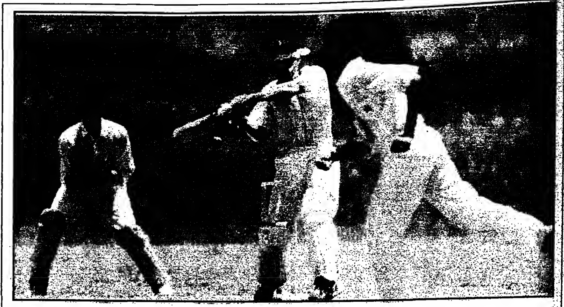
Thrashed fair and square